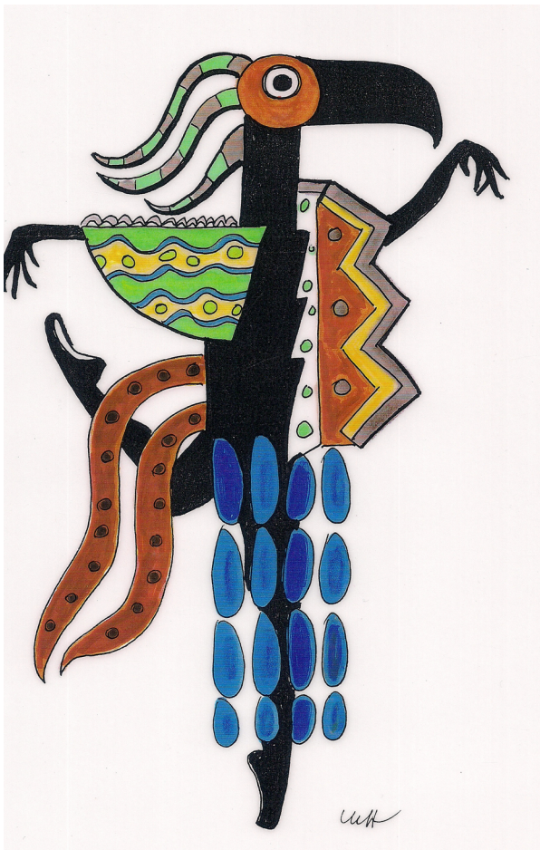
© Millicent Hodson's Birds in motion