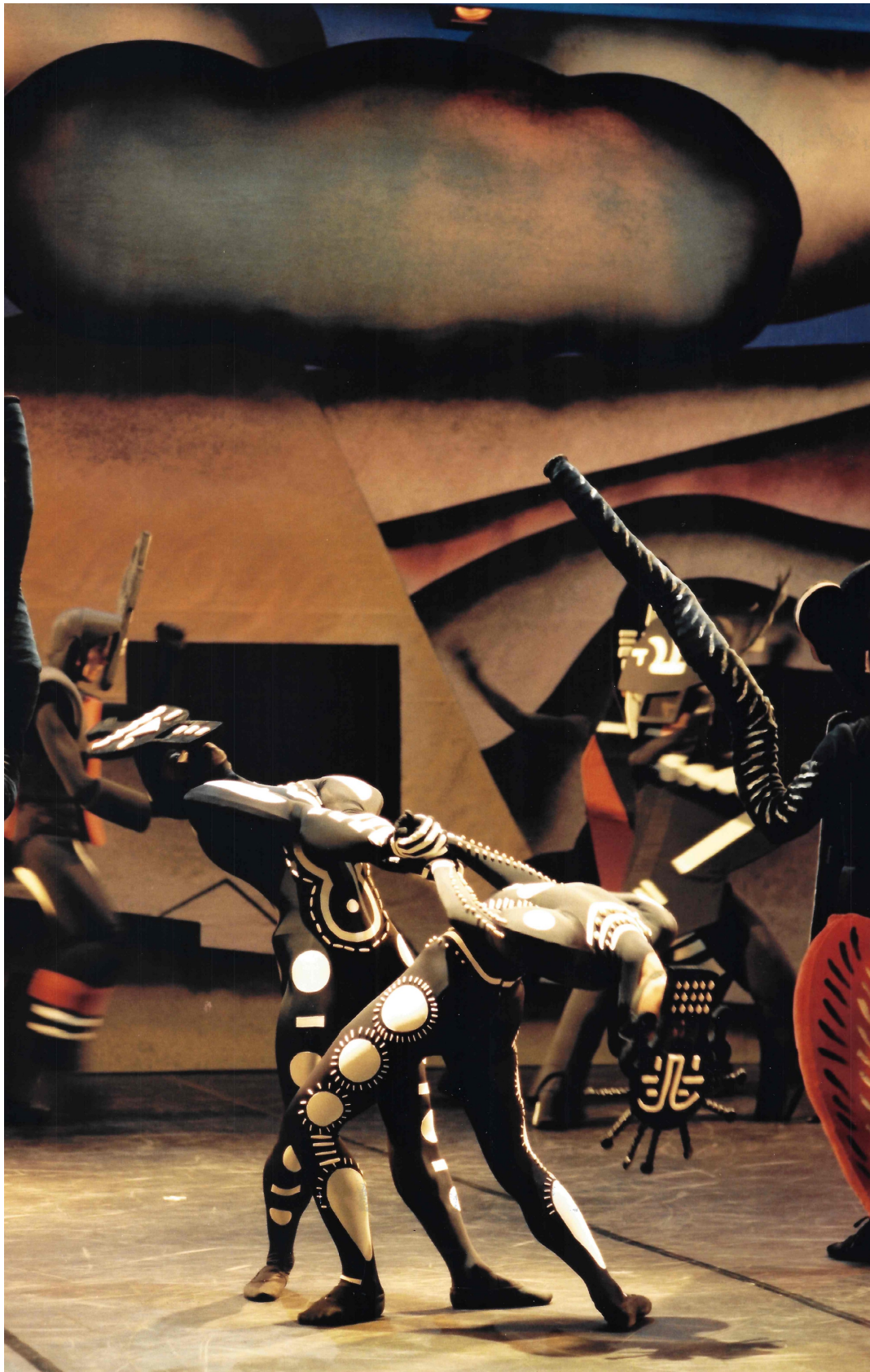
Ballet of the Grand Théâtre de Geneve stage from 2000.